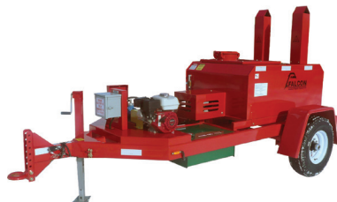
TACK TANK TRAILER