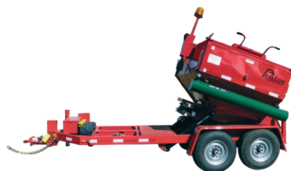
ASPHALT HOT BOX AND RECYCLER

Falcon Asphalt Repair Equipment 2600 W. Salzburg Rd. Freeland, MI 48623 sales@falconrme.com