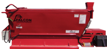
SLIP IN MODEL