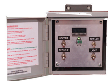
Patented VIP - Low Voltage Shutdown

Falcon Asphalt Repair Equipment 2600 W. Salzburg Rd. Freeland, MI 48623 sales@falconrme.com