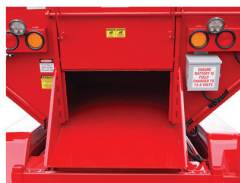
Large Unloading Door For Easy Access