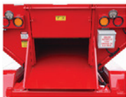
Large Material Unloading Door for Easy Access