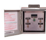
Patented VIP - Low Voltage Shutdown

Falcon Asphalt Repair Equipment 2600 W. Salzburg Rd. Freeland, MI 48623 sales@falconrme.com