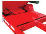
Platform For Safe, Easy Hopper Access